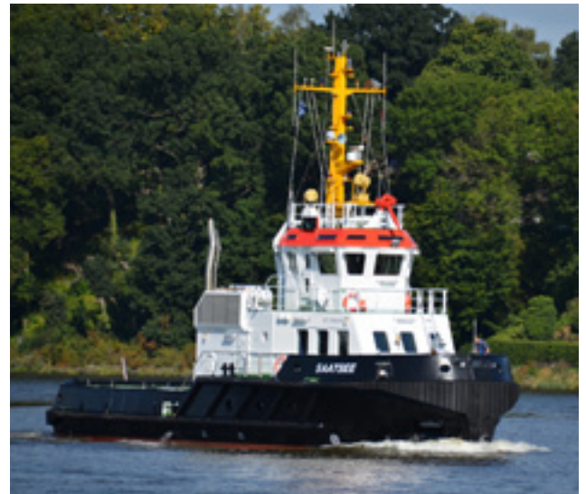
The „Saatsee“ with the bilging system of Körting Hannover AG.