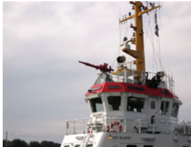
Bilging and extinguishing system with high-pressure pumping performance.

The important technical performance requirements here are the ratings of the existing mechanical monitoring pumps. Suction flows of \geq 2.000 \text{ m}^3/\text{h} can be realised.