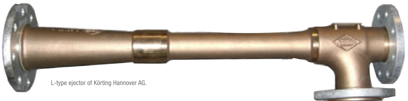
L-type ejector of Körting Hannover AG.

supply a rated output totalling 400 m 3 /h at a suction pressure of 0,4 bar abs. The suction hoses necessary for bilging are stored on board and, when needed, can be connected optionally to four connections located on the work deck.