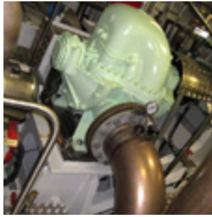
Latest technology with an increased suction performance by 1- to up to approx. 5-fold.