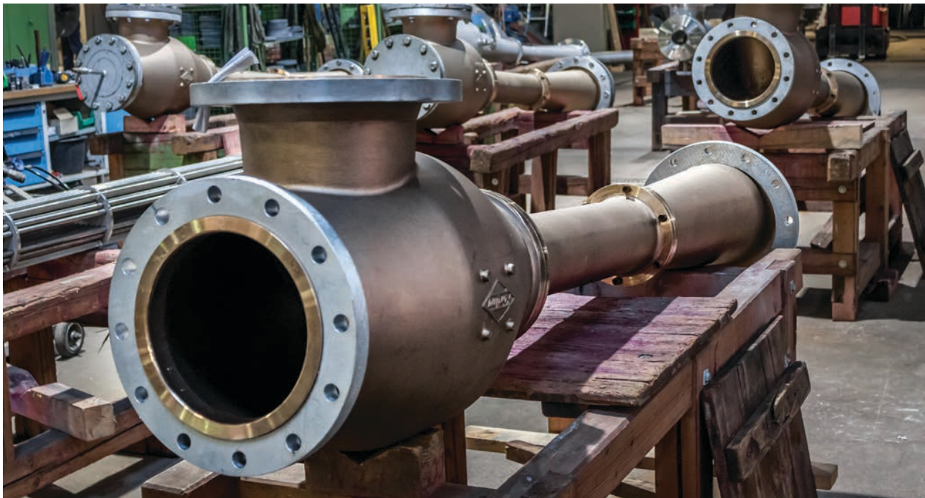
Custom-designed jet ejectors are produced and tested in the main plant in Hanover, Germany