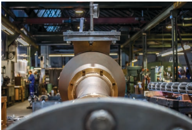
Jet ejector with suction power of more than 500 cubic metres per hour

With more than 140 years' experience in jet ejector technology, Körting Hannover AG can offer highly efficient and proven solutions for the shipbuilding industry. The current project for the Chinese COSCO Dalian shipyard shows just how customised these solutions can be.