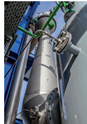
Körting Venturi scrubber at work.