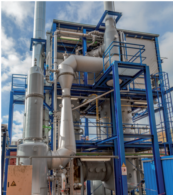
Körting testing field for optimisation.

availability. This high-grade steel plant for applications with volume flows of up to around 40.000 Nm 3 /h is fully operational in the meantime. With regard to the collaboration between the two companies, Beta Renewables expressed themselves very positively: „Körting is a reliable and important company for us. The delivery of the Venturi scrubber took place within the designated time and start-up went according to plan and without the occurrence of any problems.“