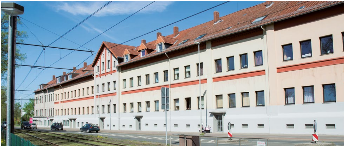
The former Körting management building includes over 14 different separate houses and is currently used as a residential property.