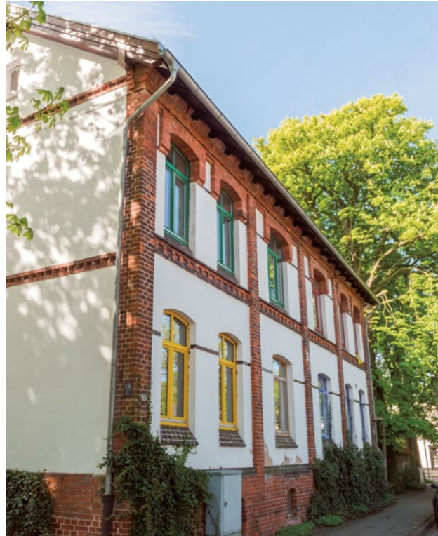
One of the two remaining residential Körtingsdorf houses.

Körting Hannover AG's current factory is located where the company's own electricity plant used to be. Nowadays the company is still producing its technology in Hanover-Linden and exporting it all over the world.