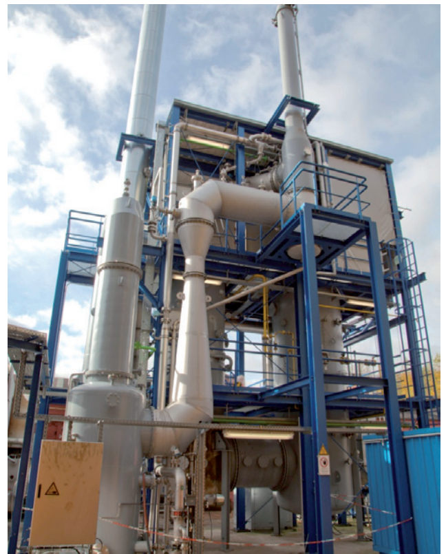
Test field (facility) for optimisations.

„The particle size distribution of a dust requiring separation is the initial limitation in the choosing of a suitable dust separating system”, as Arnd Rötz reports. Whether a wet-working or a dry system should be applied is determined by the particular characteristics of the dust in question. A wet-working system would be applied in the case of characteristics such as, for example, “hygroscopic”, “water soluble”, “tends towards solid deposits” or “sticky”.