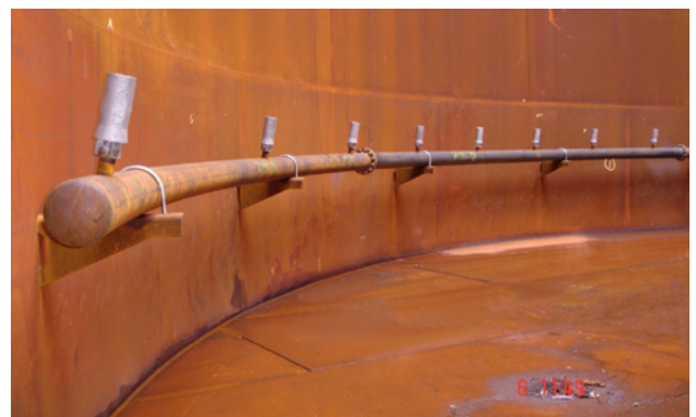
Liquid jet mixing nozzles in a crude oil tank.

All relevant demands on the mixing duties can so be fulfilled – from the aspired flow velocity in order to counter-balance inhomogeneity over the prevention of sedimentations on the floor up to avoidance of so-called dead zones in the tank. In order to achieve the preferred large-scale eddy structure the size and number of the exact positions and alignments of the liquid jet mixing nozzles must be adapted to the respective tank geometry: